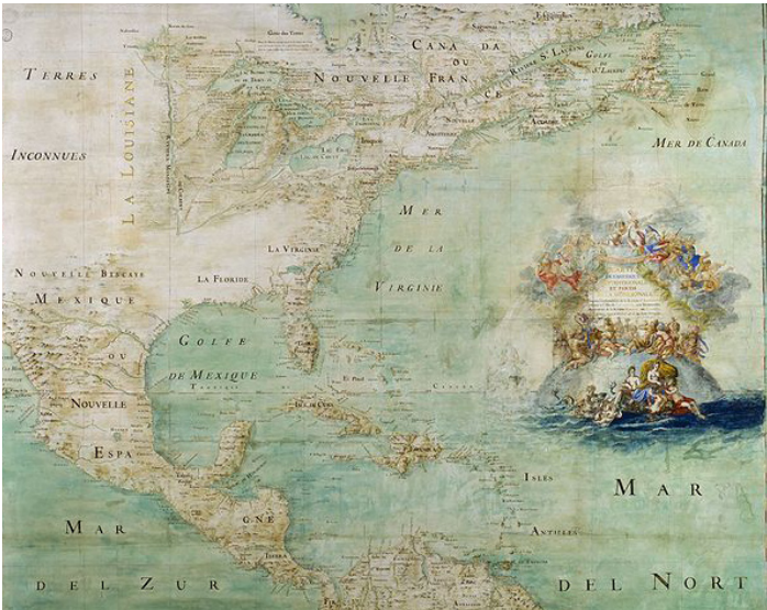
Map attributed to the Abbé Claude Bernou charting lands identified by Marquette and Jolliet while en route to Louisiana.