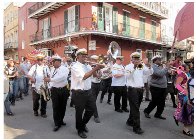
Second Line Parade in the Marigny and French Quarter neighborhoods. Treme Brass Band.

In Louisiana, lagniappe refers to a little something extra storeowners give for good measure. Tulane, New Orleans, and South Louisiana offer myriad cultural events and activities that complement graduate study. On campus, these include film screenings, pause-cafés, mini-seminars, and roundtable discussions on French theory. New Orleans and Louisiana boast a vibrant cultural scene featuring such attractions as the New Orleans Museum of Art, the Ogden Museum of Southern Art, the Contemporary Art Center, the New Orleans Opera, the New Orleans Jazz and Heritage Festival, the Voodoo Festival, the Festival International de la Musique in Lafayette, Cajun and Zydeco music performances in and around New Orleans, and, of course, annual Mardi Gras parades and festivities.