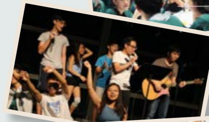
Global & Cultural Night