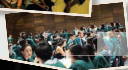
High Table Dinner