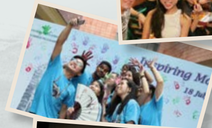
Inspiring Moments@HKU Event