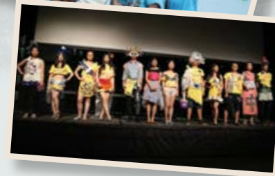
Project Runway Fashion Show