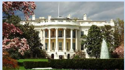
From top: Jefferson Memorial, Kennedy Center for the Performing Arts, and White House.