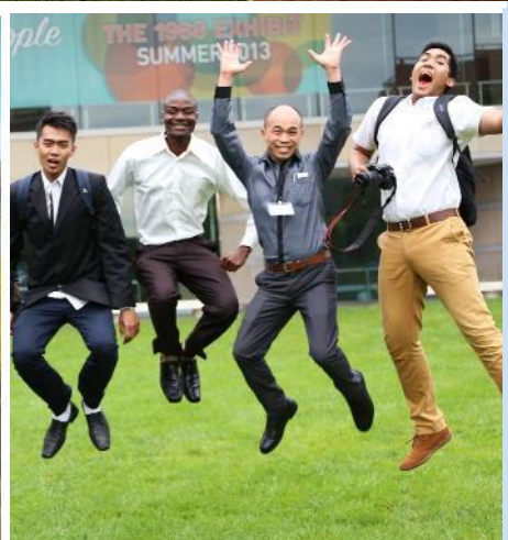
Clockwise from top left: National Constitution Center; exploring historic Philadelphia; Philadelphia former Mayor Hon. Wilson Goode; Independence Hall, site of the signing of the U.S. Declaration of Independence and Constitution; excitement building; in front of the National Constitution Center; signing the ‘Constitution’; forum on U.S. founding principles.