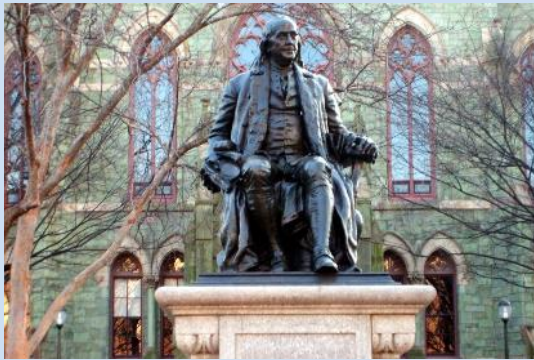
University of Pennsylvania