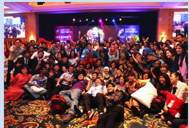
From top: First IYLA at the King Center in Atlanta; Second IYLA at the United Nations in New York; Third IYLA in Kuala Lumpur, Malaysia.