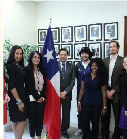
Clockwise from top left: A delegate enjoys the program; IYLA at the United Nations Headquarters with 600 participants from 74 countries; high-level panel on youth leadership; visit and briefing at the Chile UN mission; youth panel at the UN; New York City cultural expedition.