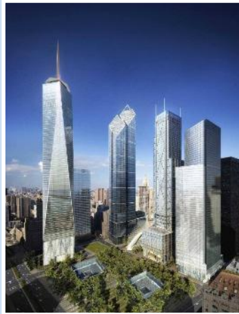
Statue of Liberty and Freedom Tower, 9-11 Memorial